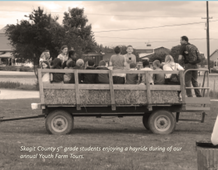
Skagit County 5 th grade students enjoying a hayride during of our annual Youth Farm Tours.

SPF exists to ensure the continued viability to Skagit agriculture and its required infrastructure through farmland protection, advocacy, research, education, and public awareness.